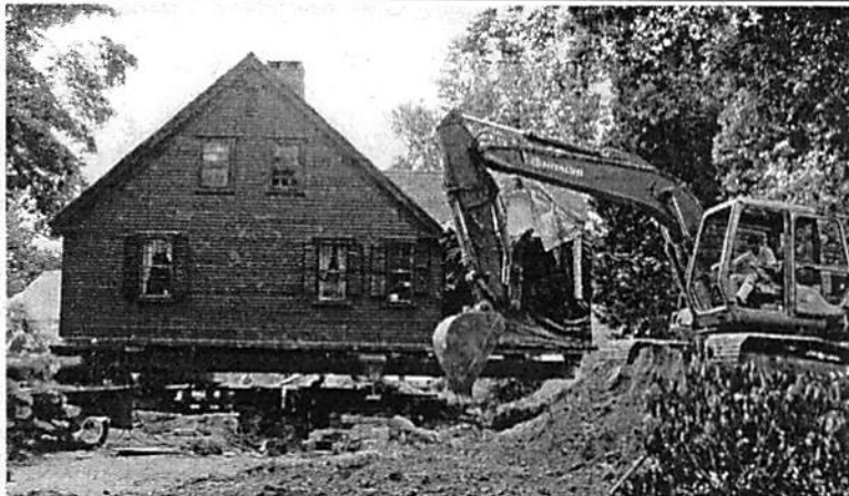
A bit of Duxbury history is preserved on St. George Street as this 200 year-old home, the former Delano summer home, is turned 180 degrees to face the street. A full basement will be added to the home, along with an addition to the main structure.